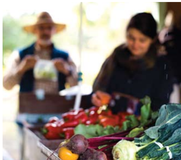
Fred Bixby's gift to UC Davis in 1955 to support "training in practical agriculture" was endowed in perpetuity and provides a stable resource base for the Student Farm, where students gain hands-on farming experience.

Outreach: We share our discoveries with many people and groups that can spur positive change.