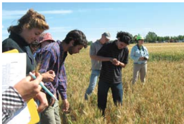
The Columbia Foundation and Clarence E. Heller Charitable Foundation supported the creation of the interdisciplinary new major in Sustainable Agriculture and Food Systems.