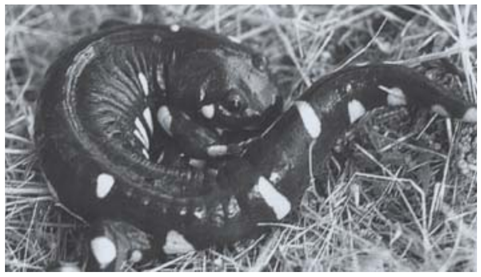
California tiger salamander (endangered in Santa Barbara and Sonoma counties).

vae often are awkward and lack effective defensive or escape mechanisms; thus amphibians may require breeding habitat that affords temporal or spatial isolation from predators. A key problem arises in that the aquarium trade includes several species of introduced, exotic fish, amphibians, and reptiles that may be released into the wild, inadvertently dispersing parasites and pathogens that affect native amphibians. In light of their apparent great sensitivity, amphibians may serve as an early warning system for environmental degradation.