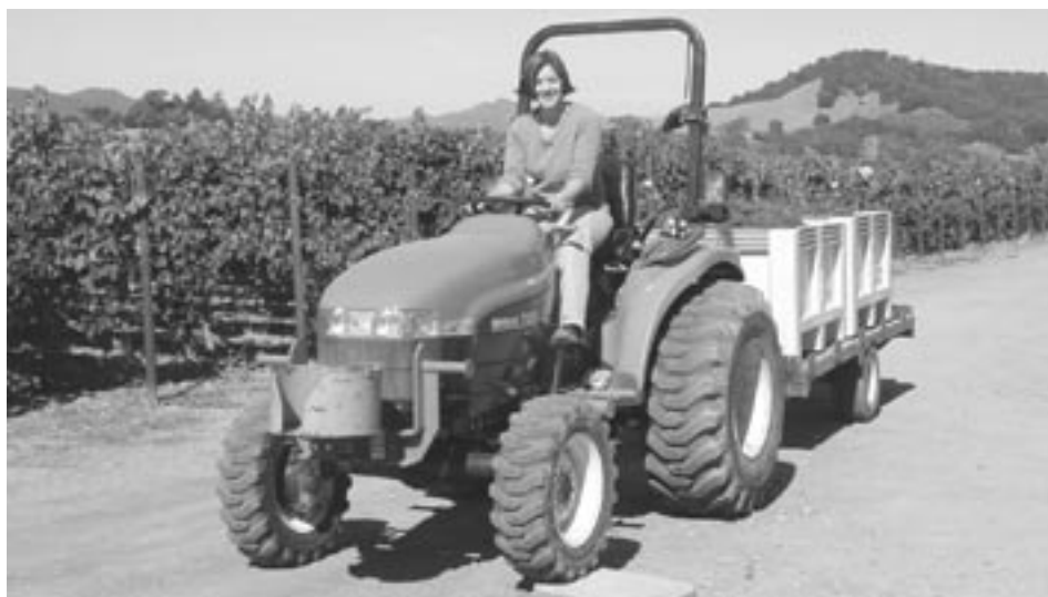
Researcher Lissa Veilleux collects vineyard harvest data.

Warwick (1991) documented herbicide resistance in more than 100 species, highlighting the importance of exploring non-chemical weed control options. Shifts in weed populations, however, are not only associated with herbicides but with cultural practices as well (Liebman and Gallandt 1997). For this reason, it is important to