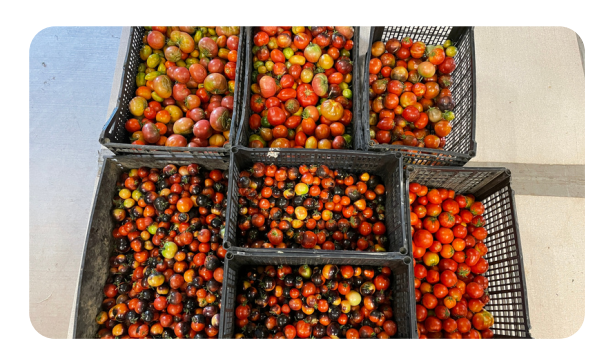
Looking for an internship? Want to learn more about the Student Farm? Visit: asi.ucdavis.edu/programs/sf. You can also follow the Fresh Focus Instagram at @ucdfreshfocus

"Plant breeding involves discarding most of what we grow. In a field of tomatoes, we may only harvest half of the plants for our data collection and pick a few crates for seed saving. This leaves hundreds of pounds of tomatoes on the vine that would otherwise go to waste after we've collected our data. I feel very strongly about reducing waste and ensuring that our hard work helps as many people as possible. With the help of Fresh Focus, we can send out a lot of fresh produce for only a little bit of extra effort on our end. I'm really proud of the work we've put in to donate our extra tomatoes, zinnias, beans, and whole wheat flour to the campus community and beyond." from Laura Roser, SCOPE Manager