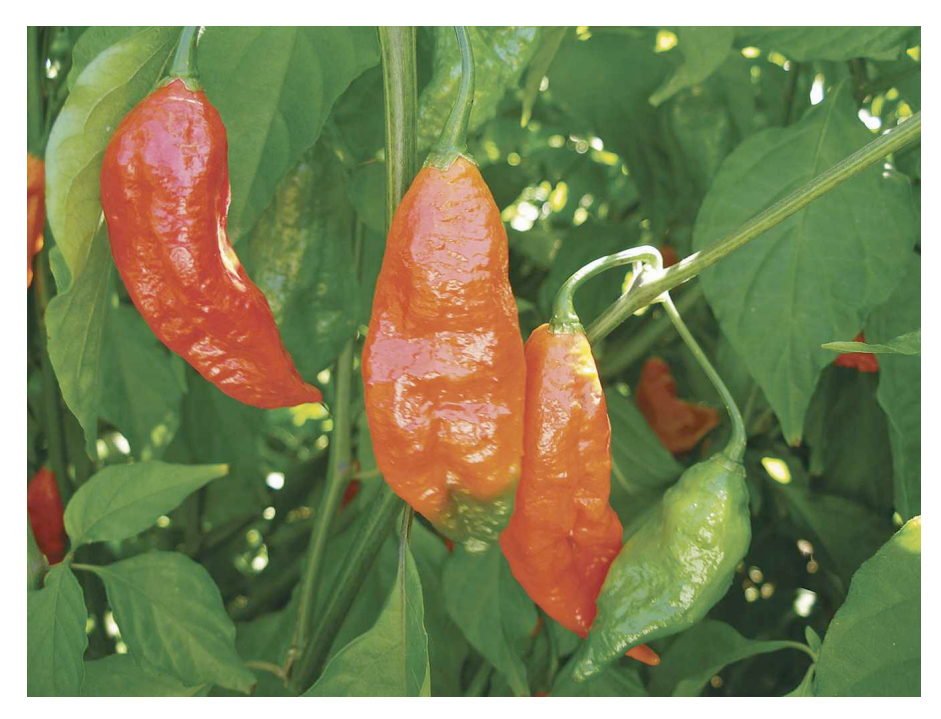
Fig. 1. Fruits of 'Bhut Jolokia' on plants grown in the field at the Leyendecker Plant Science Research Center.

comparison. Cluster analysis results are graphically presented in the form of a dendrogram in Figure 3. There are three main clusters, each representing one of the Capsicum species, i.e., C. annuum, C. chinense, and C. frutescens. The C. annuum accessions included in this analysis grouped into a single cluster at a similarity index value of 0.86. Similarly, the C. chinense accessions and the C. frutescens accessions grouped together to their species designation at similarity index values of 0.82 and 0.85, respectively. The C. frutescens and C. chinense clusters merged at the similarity index value of 0.45. The average genetic similarity between C. chinense and 'Bhut Jolokia' was 0.79.